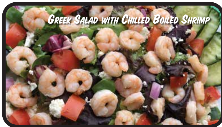
GREEK SALAD WITH CHILLED BOILED SHRIMP

SMALLER VERSION OF ANY OF OUR DELICIOUS SALADS WITHOUT MEAT AND A SMALL BOWL OF GUMBO.