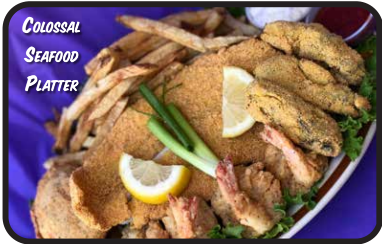
COLOSSAL SEAFOOD PLATTER